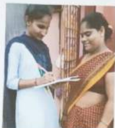
GPS Map Camera Visakhapatnam, Andhra Pradesh, India Rameswaramulla, Visakhapatnam 530040 Lat 17.70609° Long 83.296082°