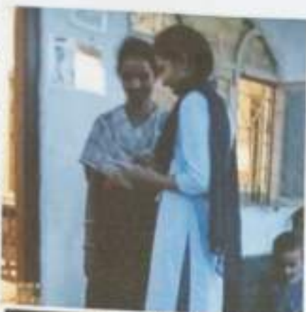
GPS Map Camera Visakhapatnam, Andhra Pradesh, India Rameswaramulla, Visakhapatnam 530040 Lat 17.70609° Long 83.296082°