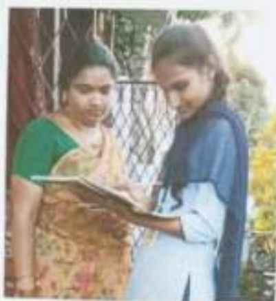
GPS Map Camera Visakhapatnam, Andhra Pradesh, India Rameswaramulla, Visakhapatnam 530040 Lat 17.70609° Long 83.296082°