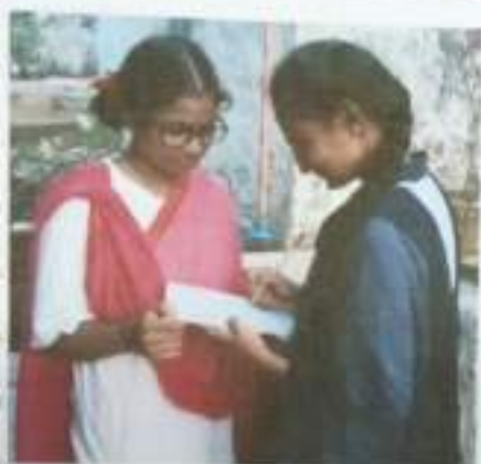
GPS Map Camera Visakhapatnam, Andhra Pradesh, India Rameswaramulla, Visakhapatnam 530040 Lat 17.70609° Long 83.296082°