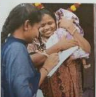
GPS Map Camera Visakhapatnam, Andhra Pradesh, India Rameswaramulla, Visakhapatnam 530040 Lat 17.70609° Long 83.296082°